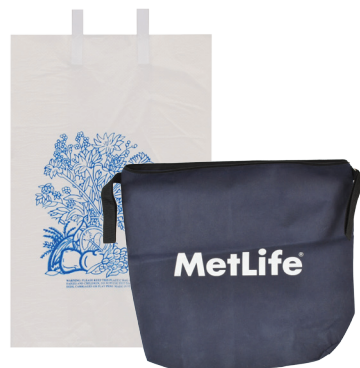
PATIENT ASSISTANCE & WHEEL CHAIR BAGS