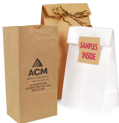
PHARMACY BAGS & LABELS

YOUR OPTIONS ARE ENDLESS - CALL US TO DISCUSS YOUR NEXT ORDER TODAY!