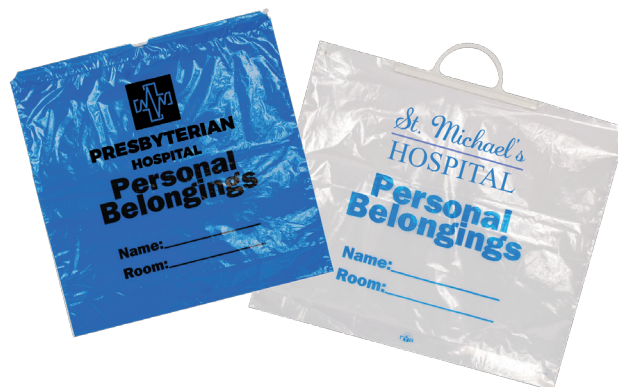
PATIENT BELONGINGS BAG