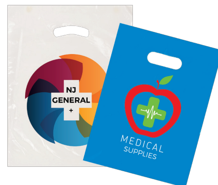
DIE CUT BAGS