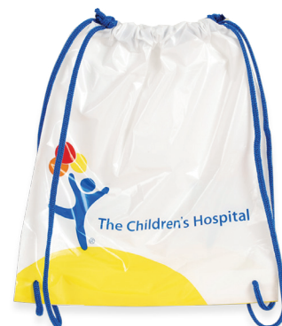
TOTES & BACKPACKS