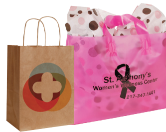
CUSTOM PAPER & PLASTIC GIFT SHOP ITEMS