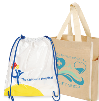
TOTES & BACKPACKS Poly & Reusable