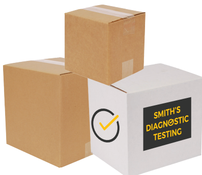
CORRUGATED BOXES White or Natural Kraft