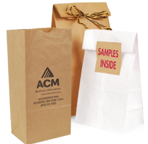
PHARMACY BAGS & LABELS