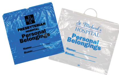
PATIENT BELONGINGS BAG Handle Bags & Drawstring Any Color Plastic