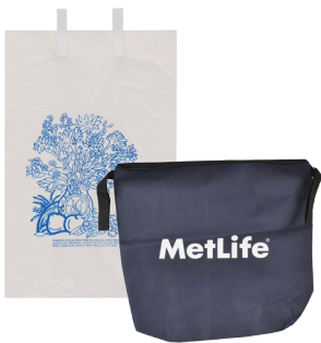
PATIENT ASSISTANCE & WHEEL CHAIR BAGS