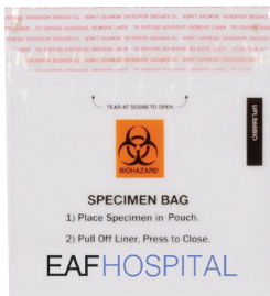
SPECIMEN BAGS Zipper & Adhesive Closures

STANDARDIZE WITH FUNCTIONAL ADVERTISING! CALL UNIFLEX TO DISCUSS YOUR CUSTOM PROJECT TODAY!